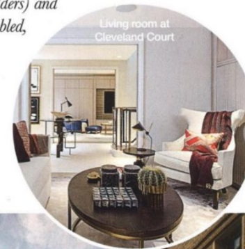
Living room at Cleveland Court