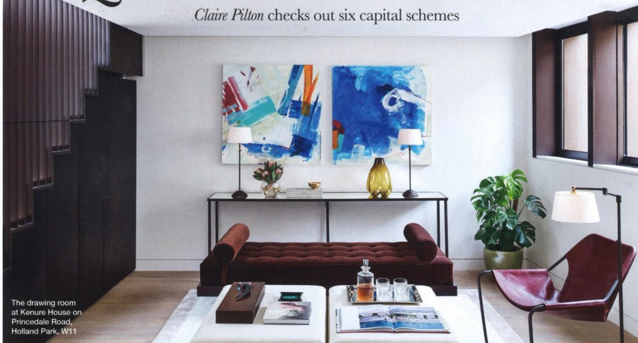
The drawing room at Kenure House on Princedale Road, Holland Park, W11

Claire Pilton checks out six capital schemes