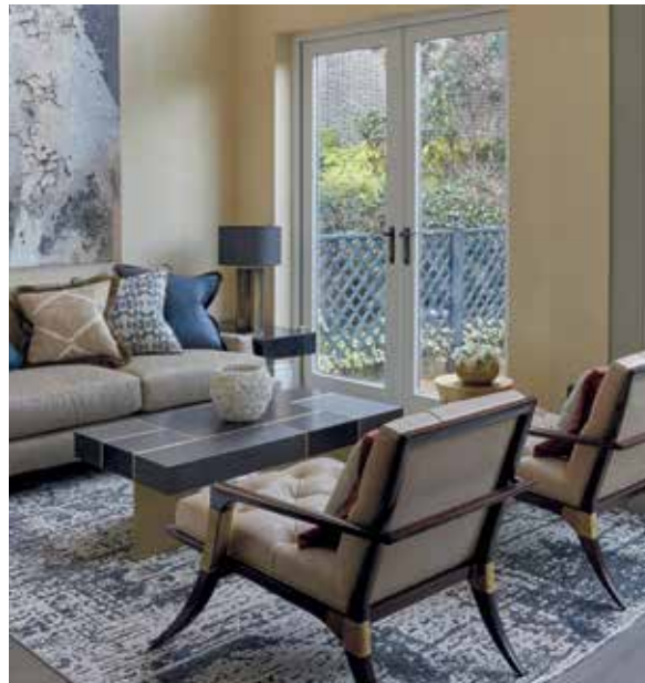
RIGHT: A house in Chelsea by Helen Green Design, which features Baker's 'Athens' lounge chair

"People are much more confident about commissioning unique things, and true luxury is about uniqueness. It's not about something having a label on it; it might be fairly understated, in fact – so good that you almost don't notice it. But what's important is that it's made to measure, for you." If bespoke is the most important component of this new era of creativity, then The Design Centre can easily be said to be at the heart of it.